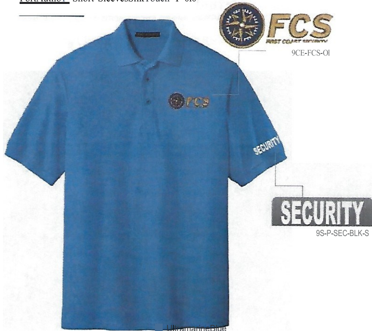
Ultra Marine Blue